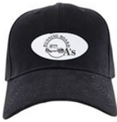
Running Board A's Black Cap With Patch $14.99