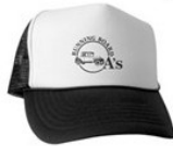
MORE COLORS AVAILABLE Running Board A's Trucker Hat $10.99