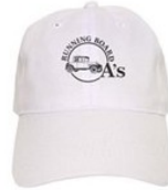
MORE COLORS AVAILABLE Running Board A's White Cap $14.99