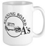
MORE COLORS AVAILABLE Running Board A's 15 Ounce Mugs $11.99