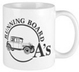
MORE COLORS AVAILABLE Running Board A's 11 Ounce Mugs $10.99