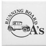
Running Board A's Tile Coaster $4.50