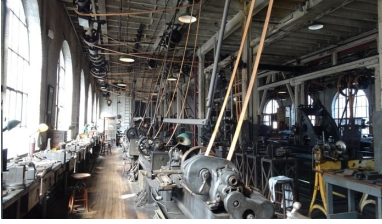
Belt Drive machines powered by remote steam engine

After exploring all three floors at my pace (translate out to really slow - I am an engineer you know), we drove up to Glenmont, the estate of Thomas and Mina Edison (his second wife). He purchased this 29 room home and property for his second wife, in 1886 at a discount ($125,000.00, including most of the furnishings). The original owner/builder had financed the building, at a cost of over $250,000.00, with money embezzled from his employer.