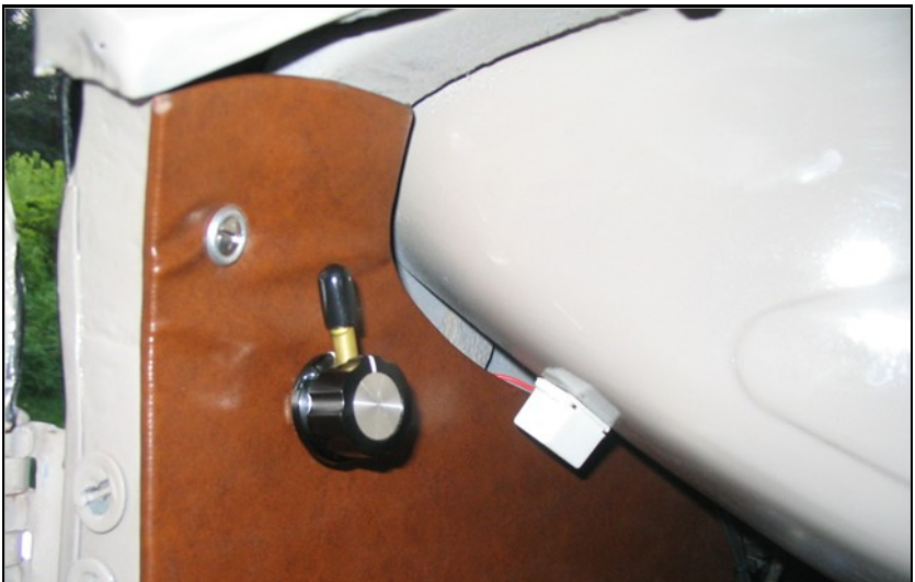
The new location of the turn signal switch in the Roadster.