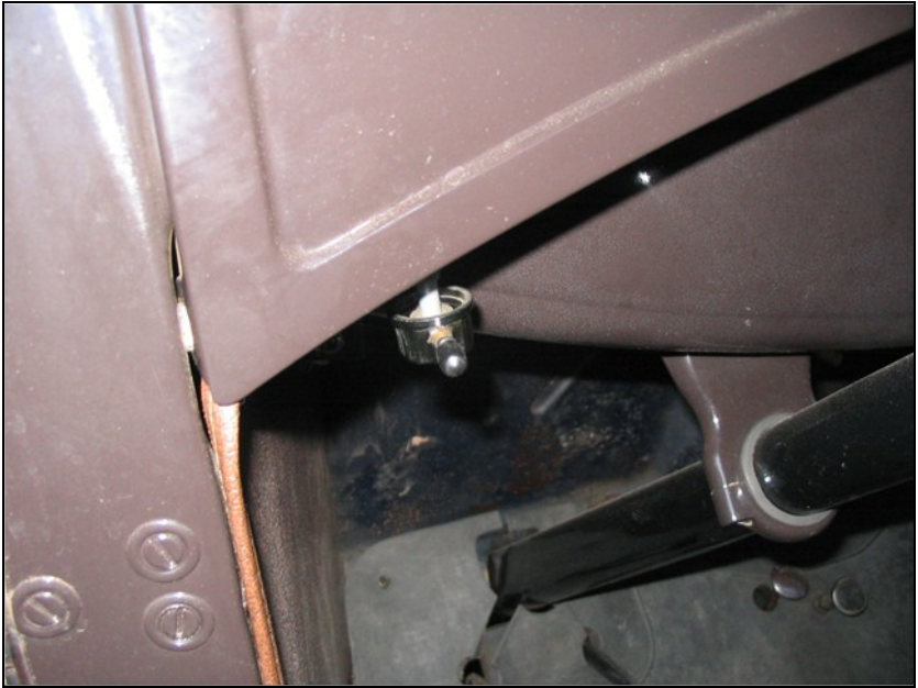
The old location of the turn signal switch in the Roadster. This is actually in the Tudor, so the wires aren't visible.