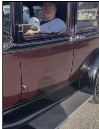
Proud owner of a Model A