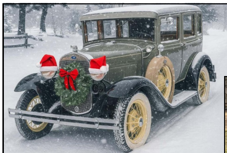
Doru's Fodor decked out for the holiday with some AI generated snow