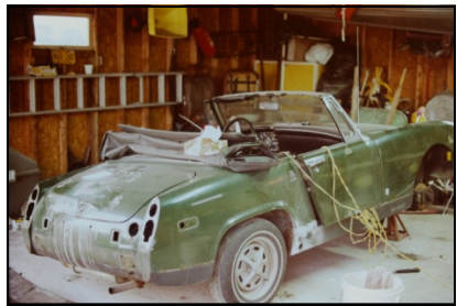
1976 MG Midget undergoing restoration in 1985.

Please submit YOUR member profile, so we can get to know you better!!!