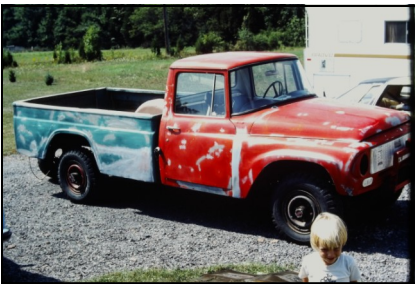
1963 International Pickup ready for paint in 1983