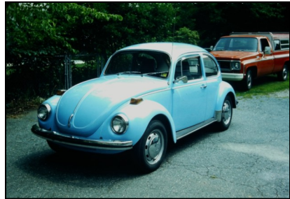
Before and after pictures of Diane’s ‘71 Super Beetle restored in 1981