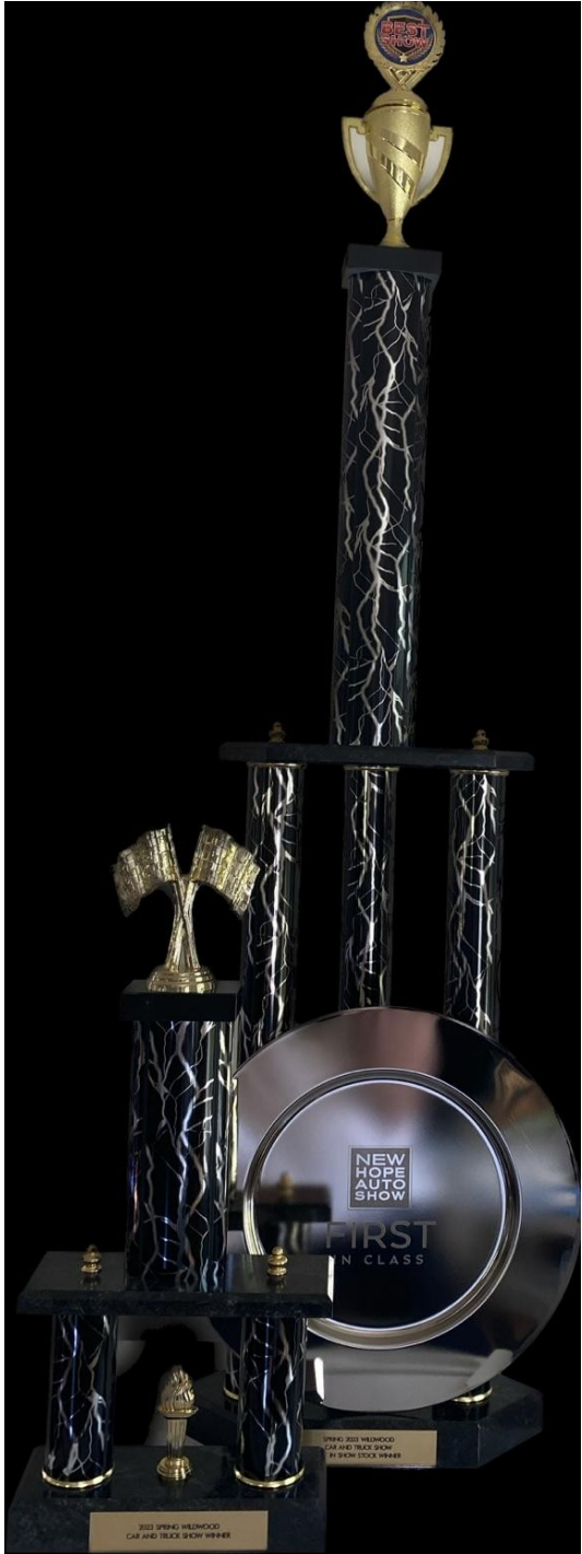
BILL SPING HELMWOOD CAR AND TRUCK SHOW WINNER