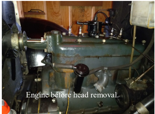
Engine before head removal.