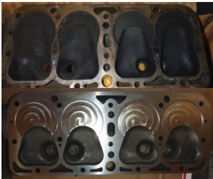
Low Compression Head

I was concerned, however, that when I had the car out on the road, there was a rattle that I couldn't seem to find. Finally, after playing with it in the driveway, I realized that you don't need nearly as much spark advance with a high compression head as you do with a standard head. It really runs like a champ now.