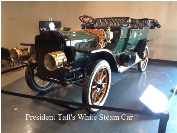
President Taft's White Steam Car

The car collection is housed in a large round stone barn, a replica of an 1826 barn found at Hancock Shaker Village in Pittsfield, Massachusetts. Cars on display sometimes rotate out of storage because even as large as it is, the collection doesn't fit on the 2 floor round display area. If it is rare it is probably here!