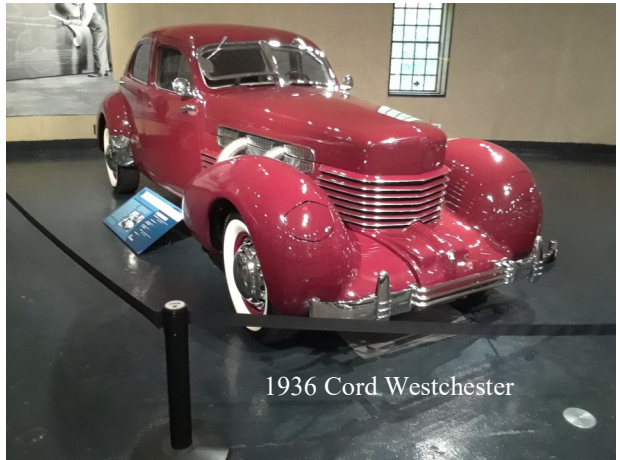
1936 Cord Westchester