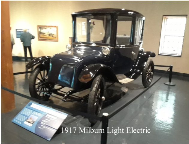
1917 Milburn Light Electric