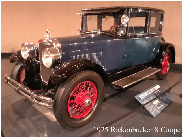
1925 Rickenbacker 8 Coupe