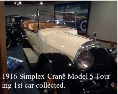
1916 Simplex-Crane Model 5 Touring 1st car collected.

1964. He also collected almost anything else you can think of from art to cast miniature soldiers, to trains and carousels. And more...including custom silver castings of cars, trains and ships. Needing a place to store and display his collections, the Museum was started. It consists of several buildings each housing a different collection all connected by pathways through many gardens of exotic and native plants and trees interspersed with sculptors.