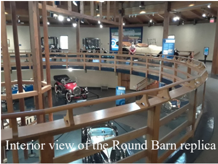
Interior view of the Round Barn replica