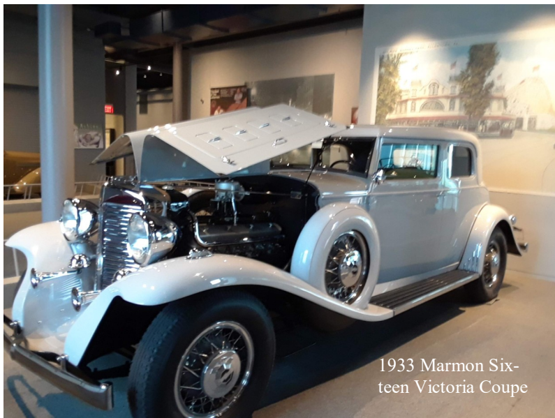
1933 Marmon Six- teen Victoria Coupe

A new collection has just arrived and will be on dis-