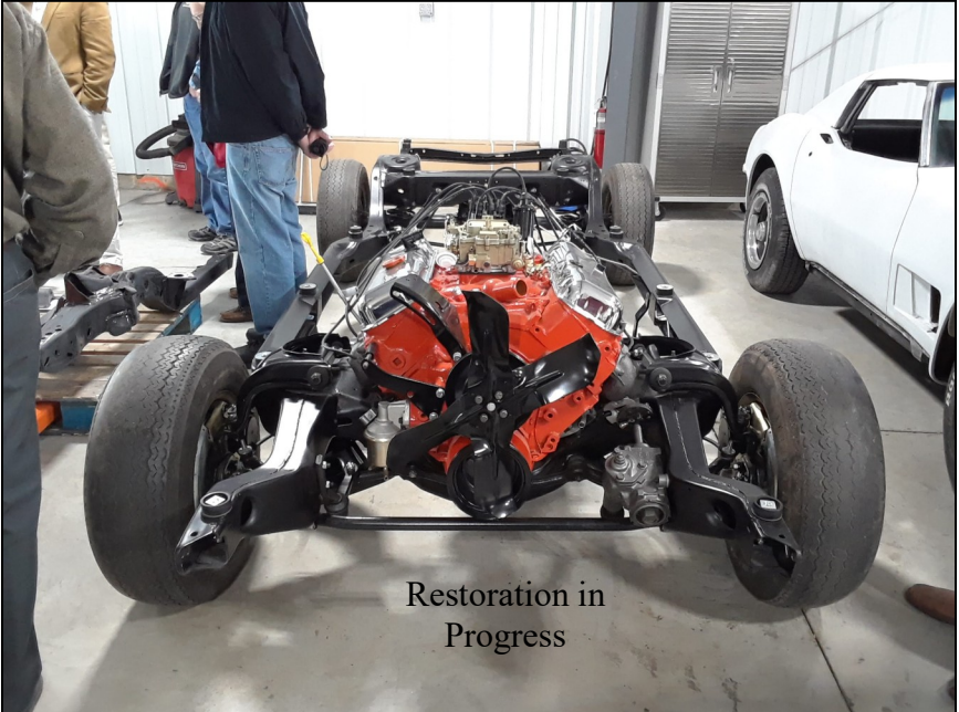
Restoration in Progress