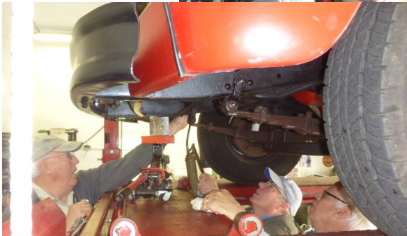
A meeting of the minds.