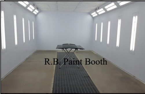
R.B. Paint Booth