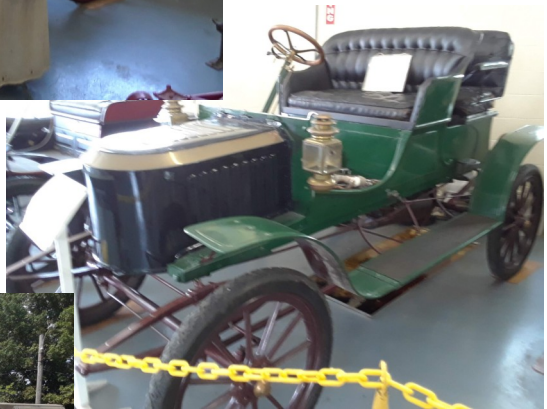
1906 Stanley Steamer, a 1904 Oldsmobile and a 1909 Sears.

New to me this year was the “Autohaus” with a quite amazing collection of rare and old cars. There were old trucks, a